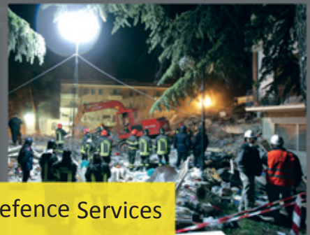
Civil Defence Services

ALT 12D - ALT 16 D Mobile Lighting Tower