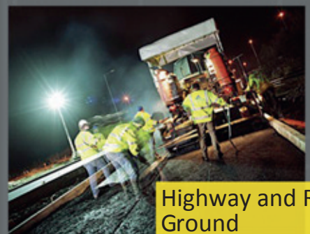
Highway and Railway Ground