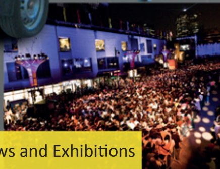
Shows and Exhibitions